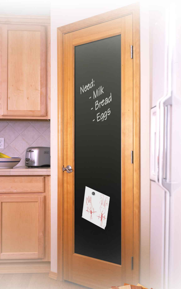
1120. Shown in Fir.