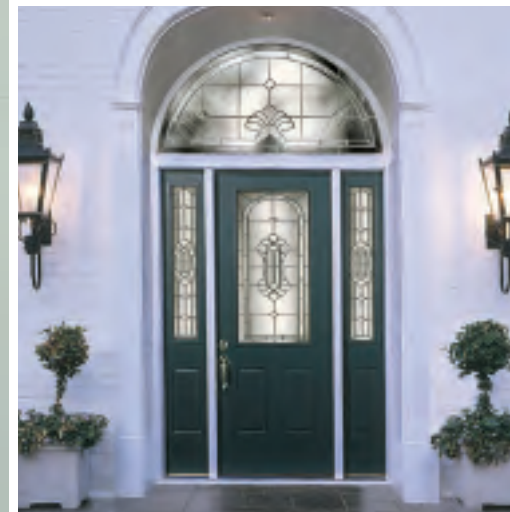
Top Left: ArTek with Seville glass, Door: ATK-105-841, Sidelites: ATKSL-200-841 Bottom Left: ArTek with Marquise glass, Door: 8'0" ATK-404-778, Sidelites: 8'0" ATKSL-450-778, Transom: C-646 Center: ArTek with Seville glass, Door: ATK-106-841