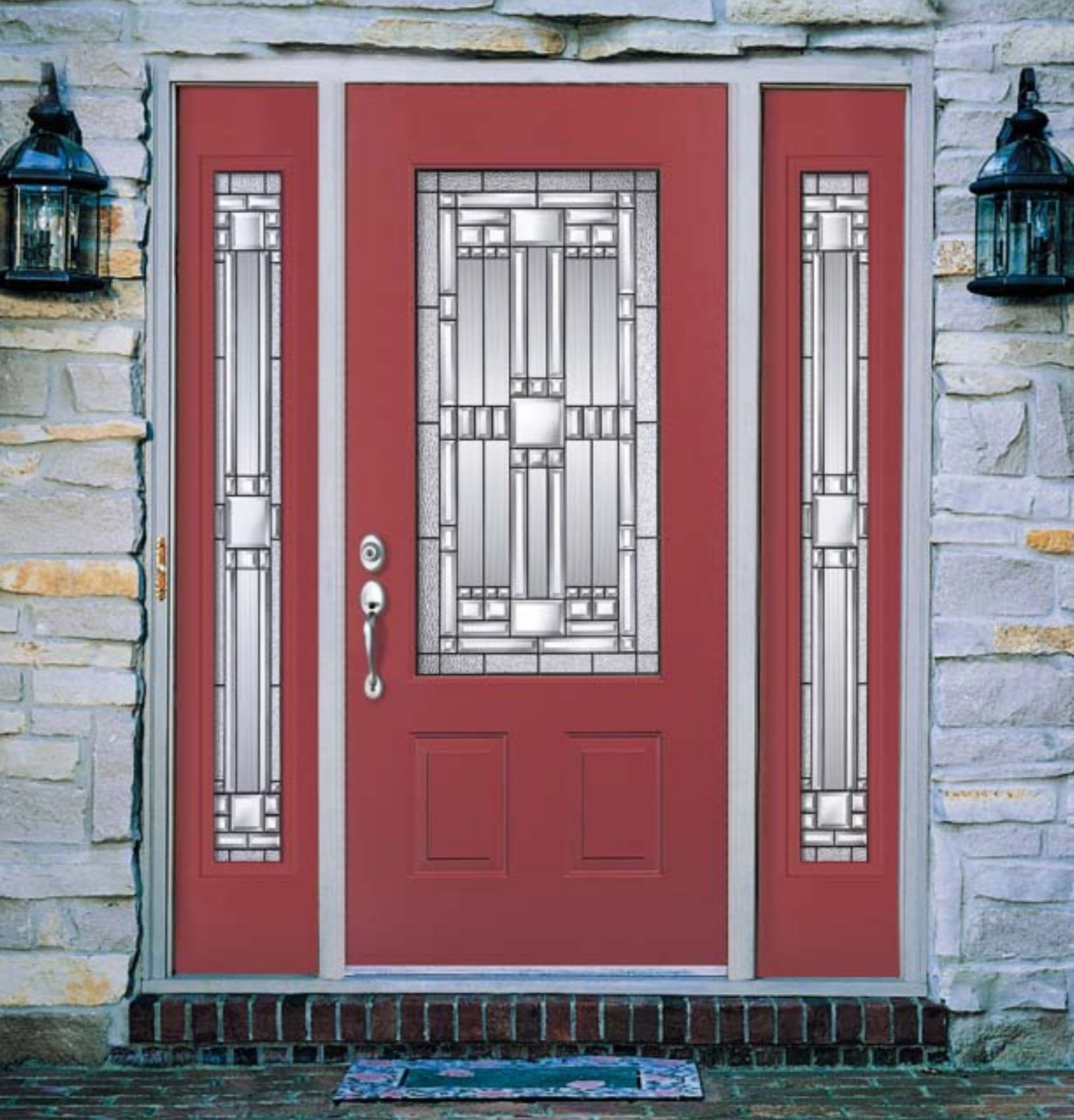
▲ Door: MMS-404-841, Sidelites: MWSSL-152-841