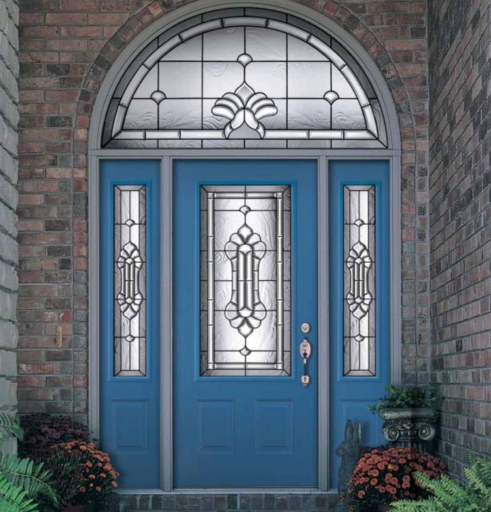
▲ Door: MWS-404-871, Sidelites: MWSSL-450-871, Transom: C-871